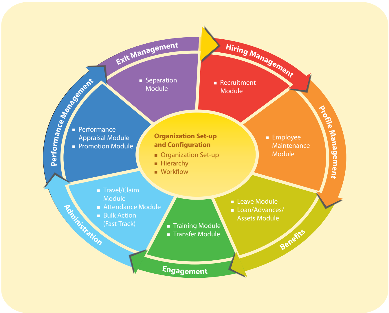
An overview of the iON Human Resources Management Solution (HRMS)